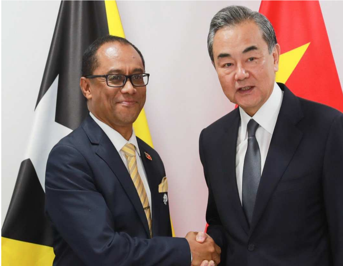
Chinese State Councillor and Foreign Minister Wang Yi meets with Timor-Leste's Foreign Minister Dionísio da Costa Babo Soares in Bangkok.

Randy Mulyanto and Meaghan Tobin. Published 23 August 2019