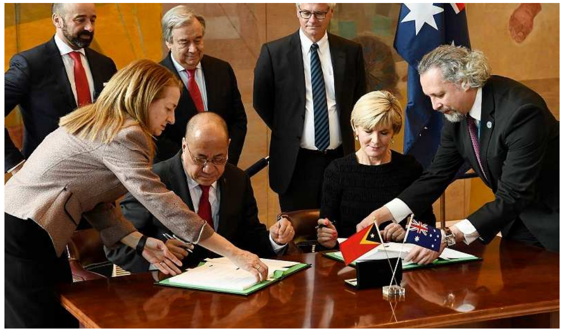
Signing the Treaty on Maritime Boundaries between Australia and Timor Leste in March following reconciliation proceedings

The options for the pipeline and their merits and ramifications have been laid out and debated at length for over a decade.