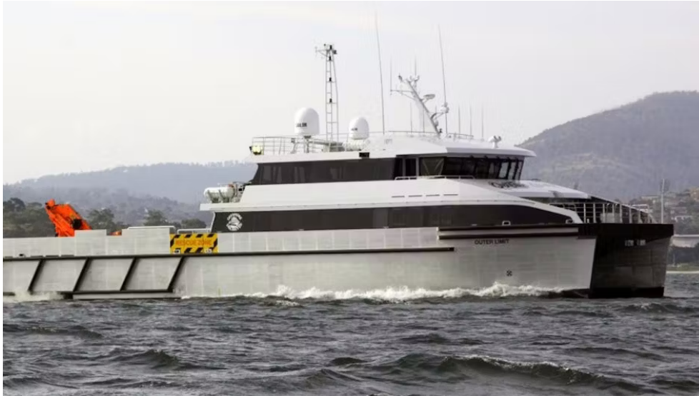
Richardson Devine Marine (RDM) Constructions' Outer Limit is a multi-purpose offshore support vessel.

The Outer Limit vessel has started a five-day environmental baseline survey offshore Timor-Leste for Sunda Energy.