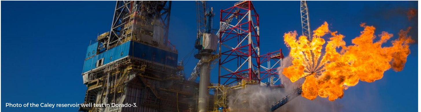
Photo of the Caley reservoir well test in Dorado-3.