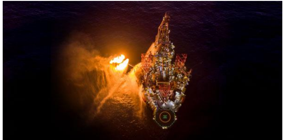
Noble Tom Prosser Drilling Rig during the Caley well test

Following the completion of the primary drilling and wireline logging, the Joint Venture completed a successful flow test of the Baxter reservoir. The flow test achieved a maximum possible