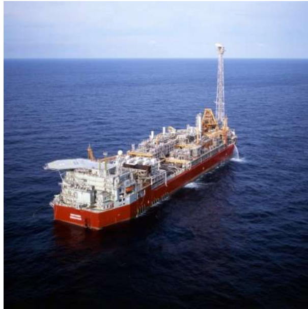
The Northern Endeavour FPSO

The Laminaria-Corallina development consists of six production wells in the Laminaria field and two production wells and one gas reinjection well in the Corallina field. These wells are tied back to the NE FPSO via three subsea manifolds and associated flowlines. Currently two wells are producing in the Laminaria field, although a second shut-in Laminaria well is expected to be reinstated during 2016.