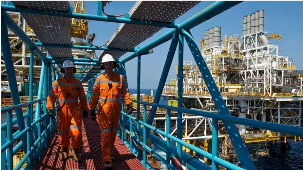
A platform at the Bayu-Undan field.

By Damon Evans , Interfax Global Energy . 6 September 2019 Asia Pacific / Exploration & Production