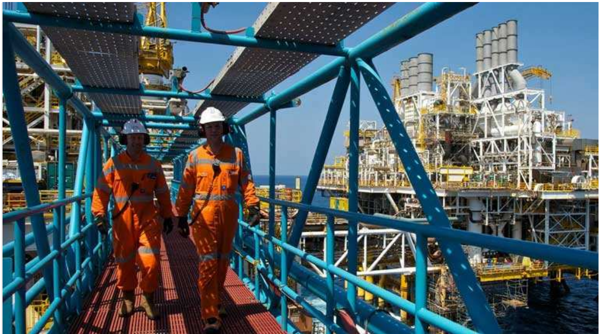
ConocoPhillips' Bayu Undan platform in the Timor Sea.

By Damon Evans 16 May 2019 Interfax Global Energy / Asia Pacific / Exploration & Production