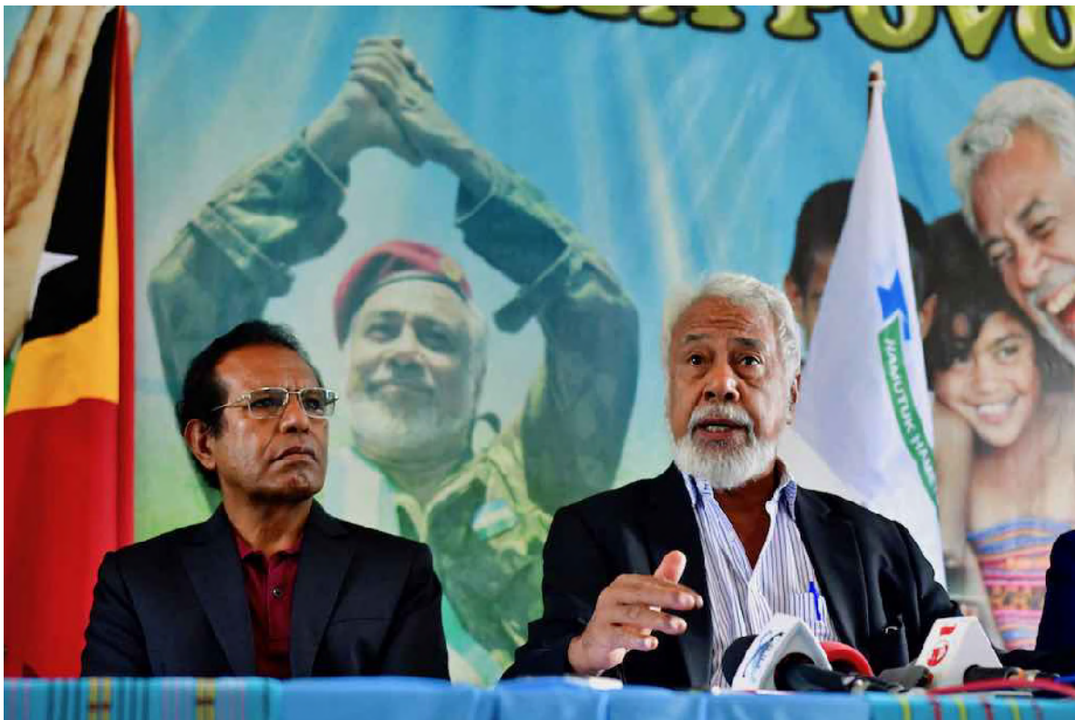
Xanana Gusmao (right) and Tuar Matan Ruak, leaders of the AMP coalition that won Timor-Leste's 12 May 2018 parliamentary election

Local politics is crucial. Politically, Timor-Leste's landscape has changed in the past 18 months, with the emergence of the People's Liberation Party (PLP) and KHUNTO. These two parties combined with the CNRT after the July 2017 election to block the ability of Fretilin and its minor party ally the Democratic Party's to govern. PLP, KHUNTO, and CNRT later combined to form the Alliance for Progress and Change (AMP) that won the subsequent poll this year in May with a clear majority.