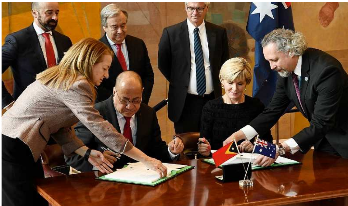
Signing the Treaty on Maritime Boundaries between Australia and Timor Leste in March following reconciliation proceedings

The options for the pipeline and their merits and ramifications have been laid out and debated at length for over a decade.