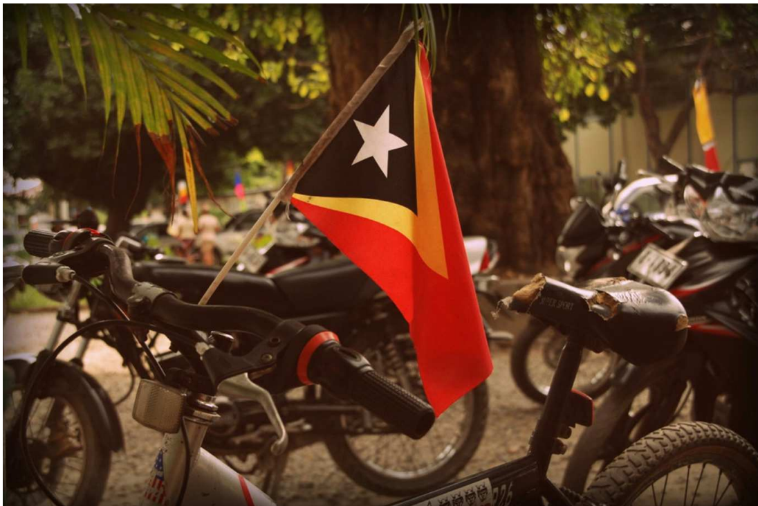
A Timor-Leste flag on a bicycle in Dili in a 2016 file photo.

Another area in which Chinese investment might play a much larger role in Timor-Leste's development is in funding infrastructure for its budding tourism sector, which has been prioritized by the new government.