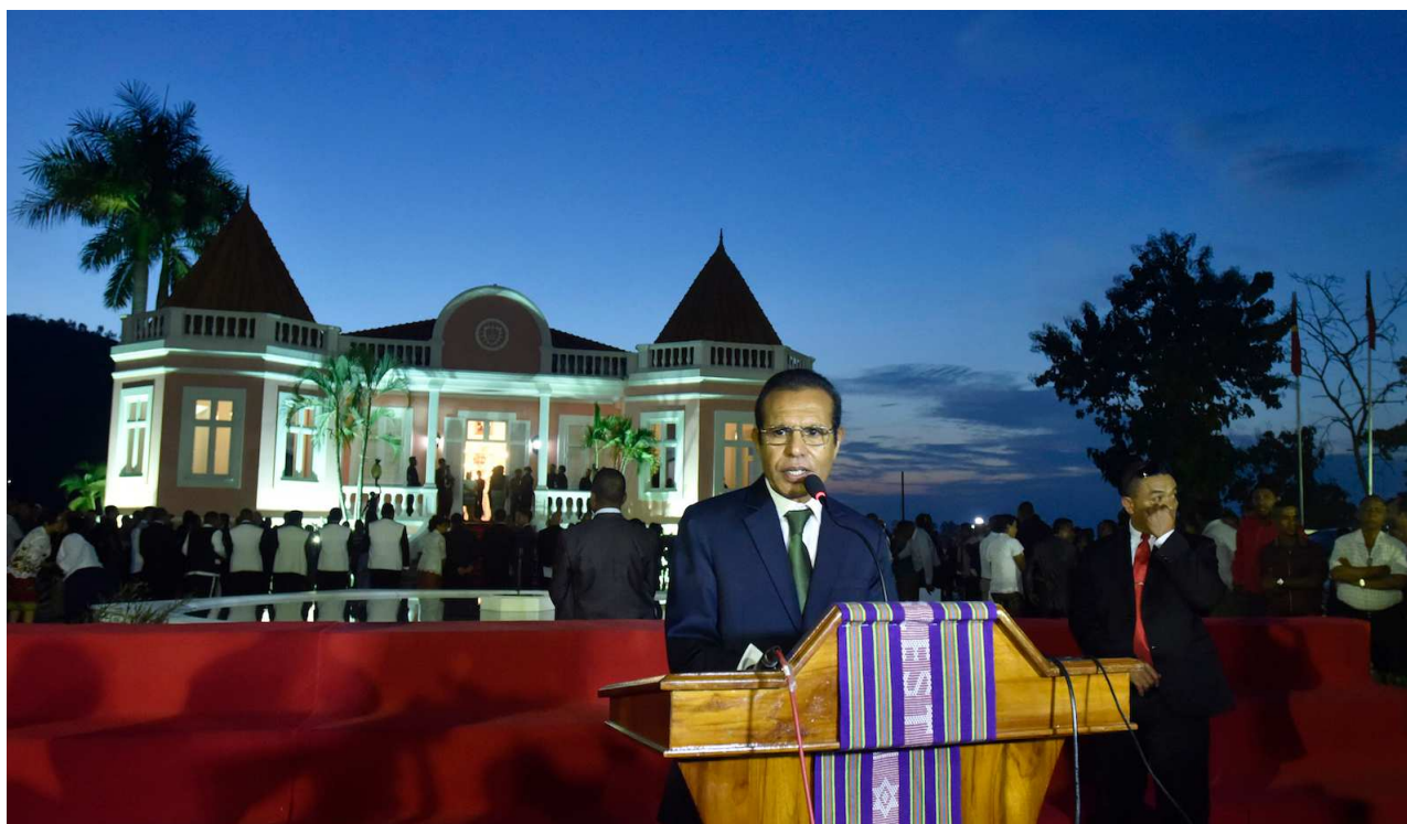
Timor Leste Prime Minister Taur Matan Ruak delivers a speech at the Palacio Nobre Lahane in the capital Dili, June 22, 2018.

However, it would also be expected to pay 30% of the consortium's capital expense for the development, which could cost several billions of dollars. That's on top of the costs for the Tasi Mane project, which could also run into the billions of dollars.