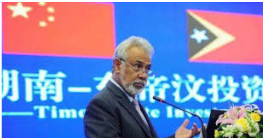
Former President Jose Ramos-Horta at a Timor-Leste and China investment promotion event.

“It's a cliché and it's silly,” he told the South China Morning Post in September, while appearing to contradict himself by saying Beijing needs to do more to help his country.