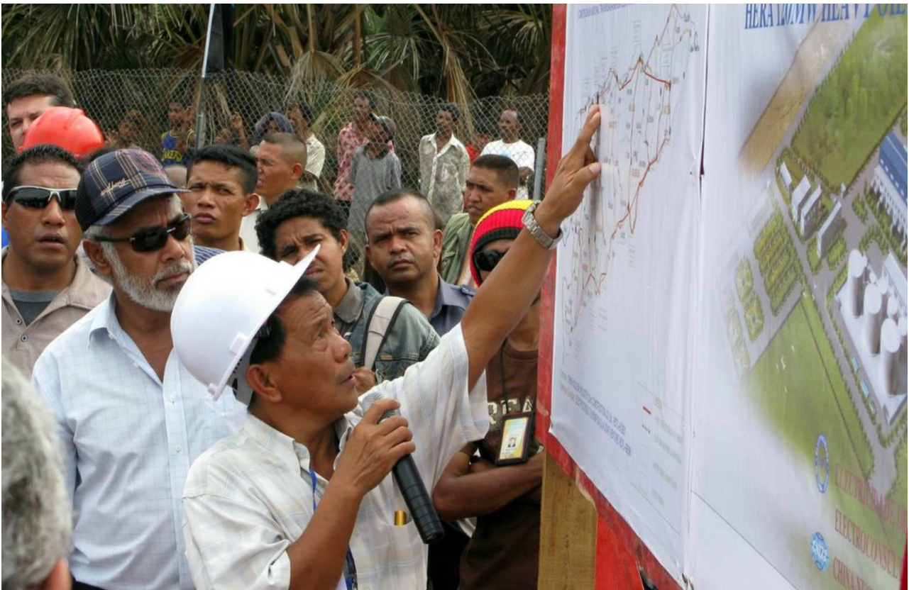
A Chinese engineer presents plans for a development project in Dili.